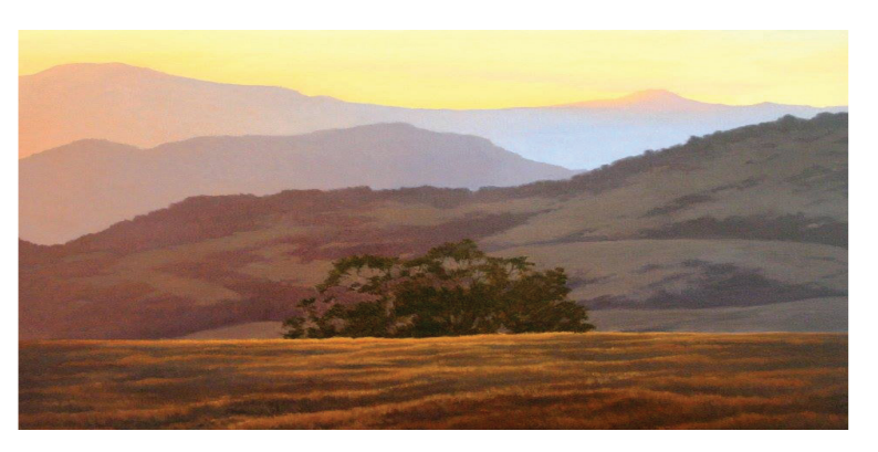
"The aim of art is to represent not the outward appearance of things, but their inward significance." —ARISTOTLE